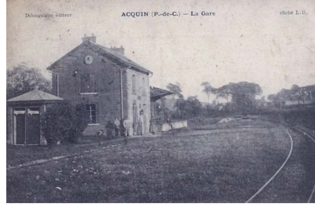
Acquin station around 1910: to the left we can see the toilets and lamp house (postcard, coll. CCHP).

Odette and Roger Méteyer in front of Acquin station, around 1935. The warehouse can be seen to the right (coll Arnauld Méteyer).