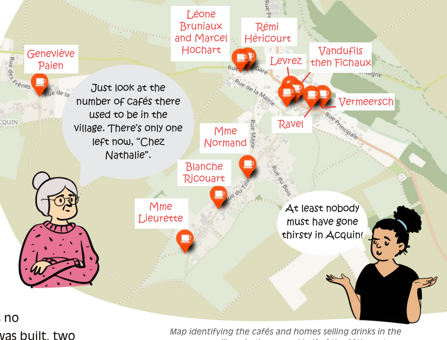
village in the second half of the 20th century.

Cafés weren't just a place to drink beer or wine though (or even the excellent mead produced by Mme Normand in Rue du Tilleuil). People would play cards or dance, and sometimes wedding parties were held there... in fact the café was a meeting place for the whole village.